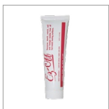
AR29 Iron cleanser paste