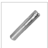
AR9 Iron cleanser stick