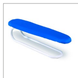
BF011 Sleeve board