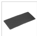
AR86 Iron cleanser mat