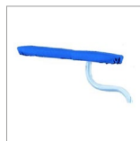
BF075 Suctioning bracket