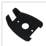
AR14 Black steamshade for Bieffe iron