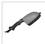
KITAV06 "Speedy" steam brush w/ilme plug