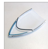
BORDERED TEFLON SHOE