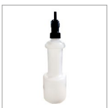
K2 Anti-drop bottle