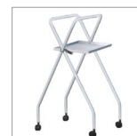
BF071 Trolley for MAXI VAPOR/MAXI VAPOR PLUS