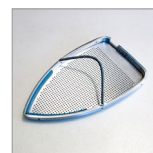
AR8C Armoured teflon shoe Bieffe iron 1,7 kg