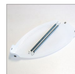
AR8G Simple teflon shoe Bieffe iron 1,7 kg