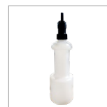
K2 Safedrop bottle