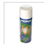
AR153 Talc spray stain remover