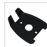
AR14 Armored teflon base