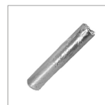
AR9 Iron cleanser stick