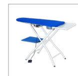
IRONING BOARDS Vacuum, heated, blowing